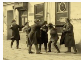
The City Without Jews

A unique group of Polish villagers—Jews, Cossacks, vagabonds—in the 1920s in a tale of romance, love, marriage, social struggles and death. A stunning film that seems to have been made in the Soviet era, but was really shot in San Diego in 1992 by groundbreaking artist Eleanor Antin. Lovingly restored by Milestone Films.