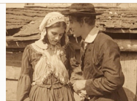
The Ancient Law

Set in the Vienna-like city of Utopia, H. K. Breslauer's 1924 The City Without Jews ( Die Stadt ohne Juden ) follows the political and personal consequences of an anti-Semitic law to expel the city's Jews. When things start to decline, the National Assembly must decide whether to invite the Jews back. The film's stinging critique of Nazism is part of the reason it was no longer screened in public after 1933. Masterfully restored by Filmarchiv Austria.