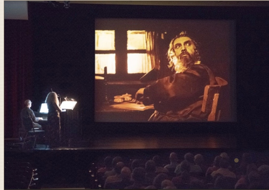
The Ancient Law

For U.S. and international touring, contact: