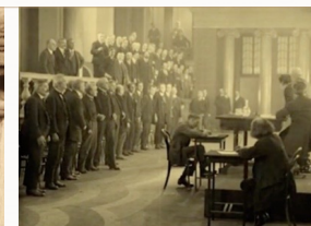
The City Without Jews