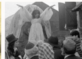
The Man Without a World