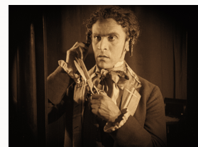
The Ancient Law

Ewald André Dupont's 1923 silent film The Ancient Law ( Das alte Gesetz ) is an important piece of German-Jewish cinematic history, contrasting the closed world of an Eastern European shtetl with the liberal mores of 1860s Vienna. With its historically authentic set design and ensemble of prominent actors, The Ancient Law is an outstanding example of the creativity of Jewish filmmakers in 1920s Germany. Beautifully restored by Deutsche Kinemathek.